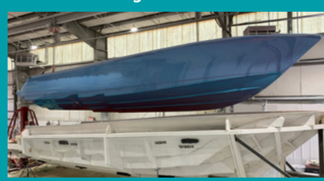
The first ever V-Series pulled from the mold.

incorporates vertical sidewall tunnels that help maintain a firm grip on the water. This ventilated tunnel design is a unique feature that results in predictable handling at running speeds. The patented Stepped-V Ventilated Tunnel delivers the softest, driest, and most efficient ride of any center console in this size range.