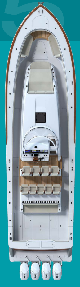
*NOTE: Specification data may slightly change after the V-55 officially launches.