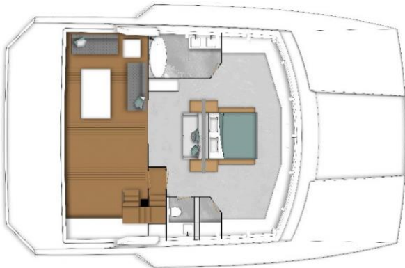
Figure 2 Owner's Deck - Interior Layout