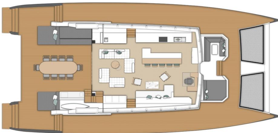
Figure 3 Main Deck - Interior Layout