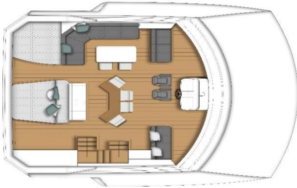
Figure 1 Flybridge Layout