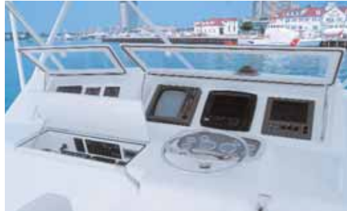
The 119 square-foot cockpit features tackle stowage, a bait freezer, a chill box in the salon step and insulated wells for fish and live bait. Molded nonslip provides solid traction yet is easy to clean and a one-piece aluminum ladder provides secure access to the flying bridge. Visibility from the bridge is exceptional. Electronics stow neatly and safely in weather protected consoles.